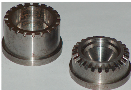
Figure 2. Set of moulds from the hollow mould