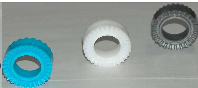
Figure 3. Satellite gear wheels cast from different plastic materials