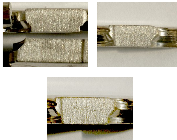
Fig. 4. Surface obtained

In the figure 5 is presented the result obtained putting one two heteronymous surfaces on vertical by comparison.