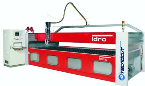
Fig. 2. Working instalation

The proper equipment of remaking his spatial plan foresee with: