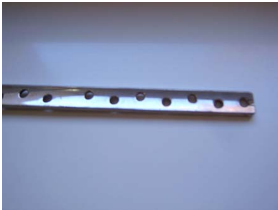
Fig. 1. Prove submissive the process of remaking

Were made the work as necessitate of replacement of the conventional technologies of remake material used biocompatible of the in medicine for the recurrence surfaces with complex forms and of a very good productivities these remaking. In figure 1 is presented one of the used proofs for remaking.