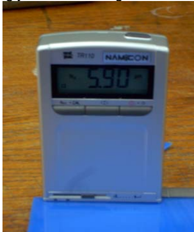
Fig. 6. Portable electronical aparat for rugosity

In the table 2 is presented the moderate values ale rugosity on the surfaces prelucrate accordingly celor three regimes of remaking.