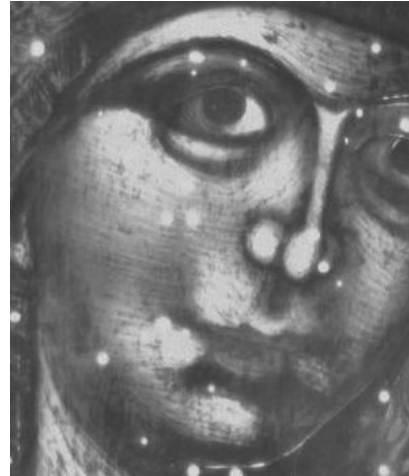
Fig. 7. UV image shows horizontal brush strokes at the surface of the figure and also the small black dots indicate the presence of the original varnish.

Fig. 6. IR image shows vertical brush strokes at the beginning of the work on character figure.