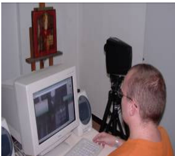
Fig. 2. Basic working principle consists in comparing sets of images taken in different wavelength modes between them or with real object

Every working mode helps the specialist to discover or to understand better some degradation related to certain layers. Images are also used to justify a precise intervention. They testify that no damage is produced by restorer or by any other person who is responsible for that object conservation