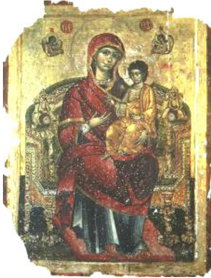
Fig. 5. “Dintr-un Lemn” monastery – XVIII century icon

of Byzantine style with a warm human expression generated by the figures of the two sacred figures