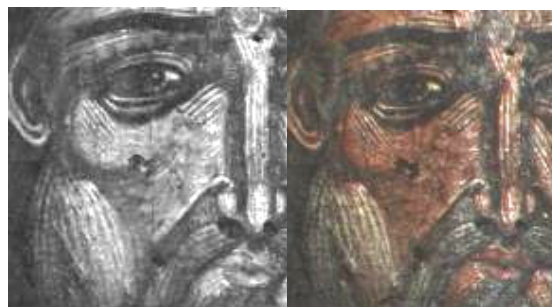
Fig. 3. IR image (left) offers a better image of the ground layer compared to visible colour image.

to the multispectral imaging analysis some valuable information regarding cleaning procedure and also offered some new ideas about the future approach of whole restoration process. Due to this analysis it was also possible to identify original inscriptions located under a recent paint layer. Successive multilayer analysis permitted distinct identification of varnish and other layer alterations.