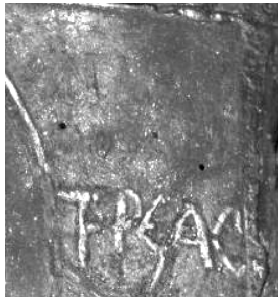
Fig. 4. UV mode provides useful information about 3D surface of the icon.

A remarkable icon, with great historical and cultural value is the icon of Mother of God with Child Jesus, located at the entrance of the Great Church of Dintr-un Lemn Monastery. This icon of a rare beauty combines in a fantastic way the stylized lines