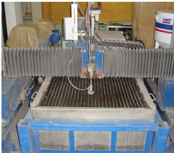
Figure 1. Water jet and abrasive cutting equipment

Cutting operations are performed on the following types of materials: metal, plastic, cardboard, glass, rubber, granite, alumina, mineral-ceramic carbides, carbon fiber. The installation is equipped with a CNC system BURNY-ETEK, comprising a library with 53 standard programs, ensuring the possibility of making cuts after a programmed contour, with the precision of the automatic tracking system to compensate the zero slot of \pm 1.2 \text{ mm} / 1000 \text{ mm} , including also materials in overlapping layers without affecting the quality of the cut surfaces. For better functionality, a device has been designed and built (Patent RO 130329 B1), which facilitates the positioning of the part to be processed with water jet, consisting of a honeycomb metal frame, with fixed and movable elements that ensure the horizontality of the device .