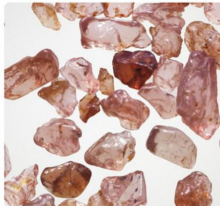
Figure 3. The hard rock garnet abrasive has sharper edges (left) than alluvial garnet abrasive, which has more rounded edges and is considered a general-purpose abrasive for most waterjet cutting applications. Photo courtesy of Barton International [8]

Usually, the abrasive used is a hard sand separated by particle size. The most used type of abrasive is the garnet, considered quite hard, resistant and cheap.