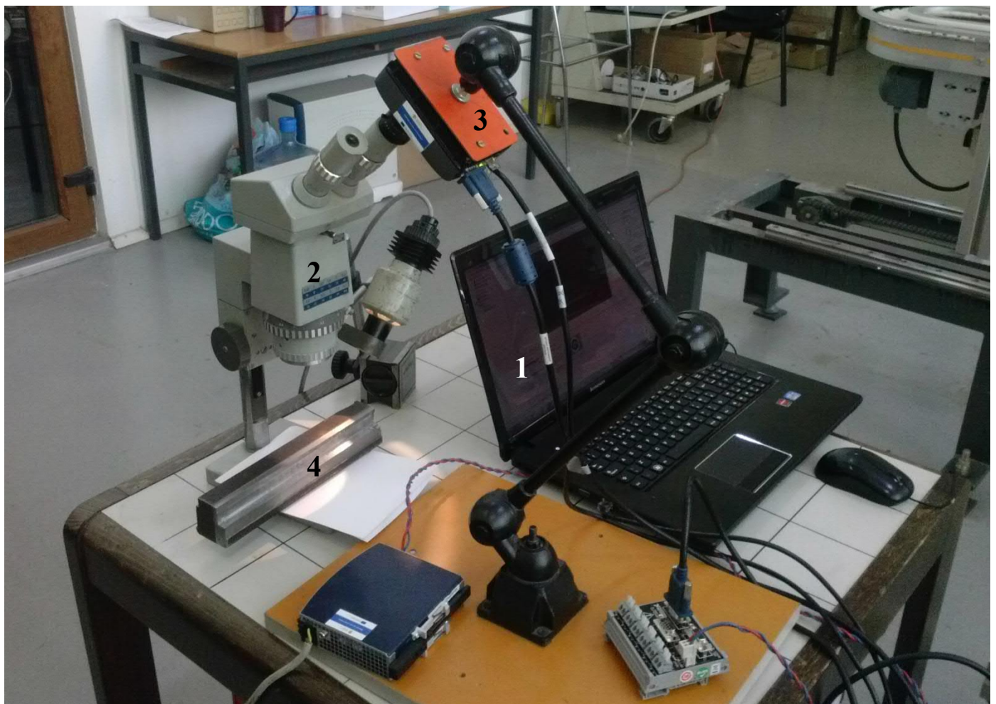
Figure 3. Image acquisition stand (1 – Laptop, 2- optical microscope,