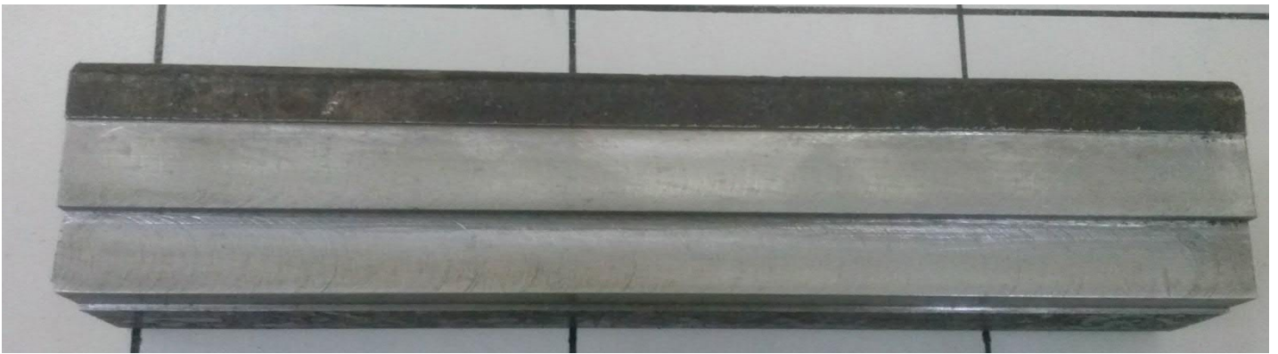
Figure 2. Workpiece milled using the tool in figure 1