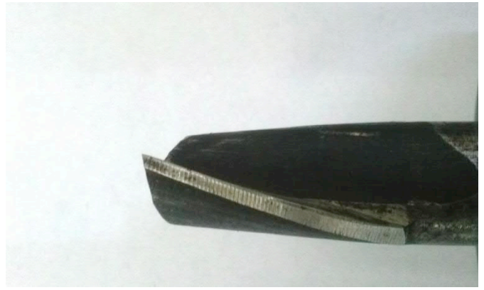
Figure 1. Milling tool used for the experiment

The linear speed of the milling tool was set at 200 mm/ minute, and the rotation of the tool was set at the 500 rpm.