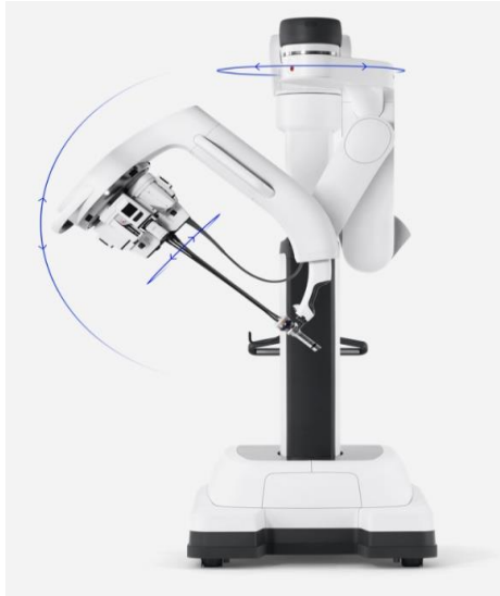
Figure 4. The Surgical System da Vinci SP [1].

Since the introduction of the Surgical System da Vinci over 5 years ago, it has been used successfully in tens of thousands of surgical procedures. Its safety and effectiveness are proven in dozens of specialized articles. The articles that support the da Vinci technique cover an extensive area of surgical interventions, covering all the surgical specialties in which it is used [4]. The advantages and disadvantages of nonconventional over conventional surgery, are described in Table 2 and Table 3.