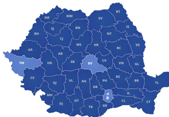
Figure 2. Robotic Surgery Center in Romania [2].

are from the latest model (the Surgical System, da Vinci Xi) and are a premiere for the Romanian private health system (Figure 2)[5].