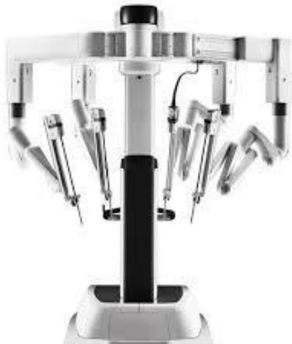
Figure 3. The Surgical System da Vinci Xi [1].