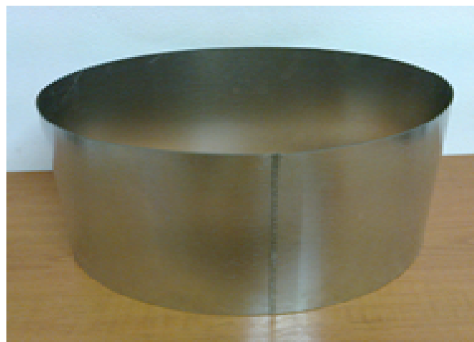
Figure 5. Stainless steel shell welded.

After the welding, the two shells were compared, both technologically and economically. It was analyzed the quality aspects of the welded joint and the labor productivity issues.