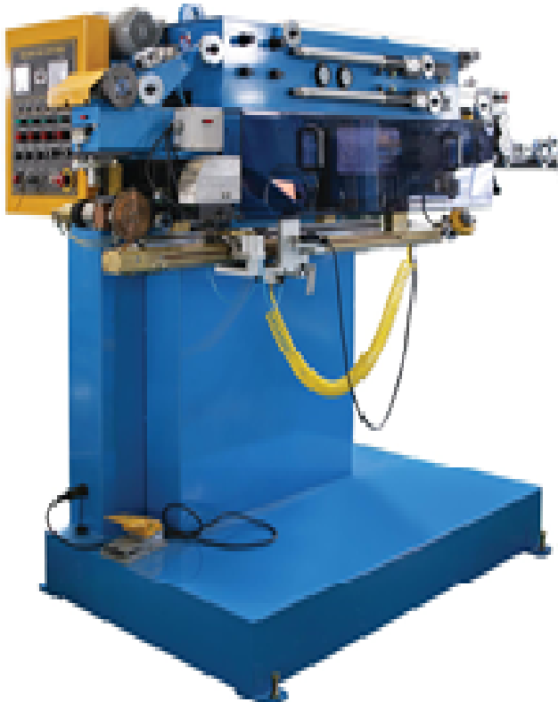
Figure 1. Welding machine with roller and wire by copper.

In order to determine the optimum of the processing conditions were tested operating modes of the machine offered by producer: