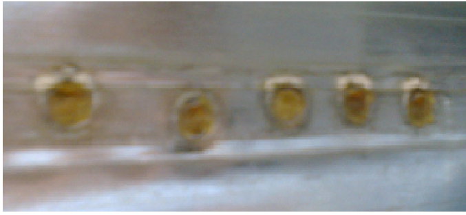
Figure 6. Stainless steels shell after spot welding.

T_{prep} – Time during the preparation of the piece for to weld