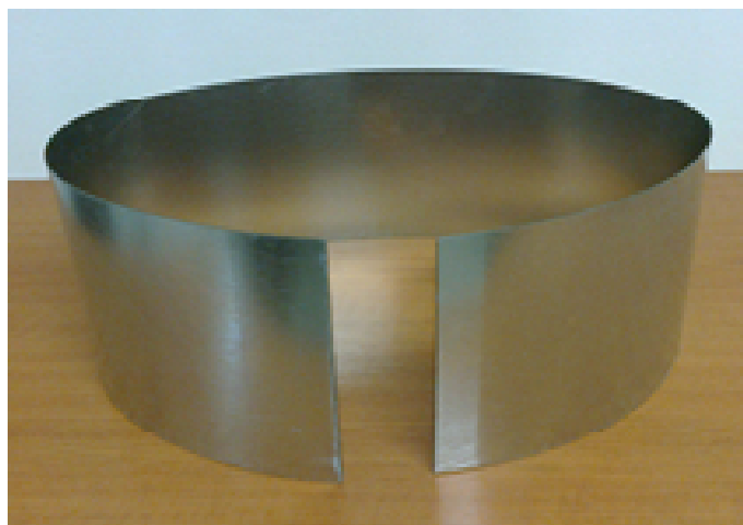
Figure 4. Stainless steel shell non-welded.

The experiment consisted of the welding on along the generator of a truncated cone-shaped shell of sheet stainless steel, with a thickness of 1 mm, in the two technological variants selected. (Figure 4)