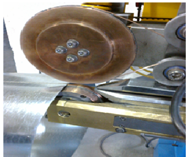
Figure 2. Detail from the welding area.

The machine includes a cooling system with water.