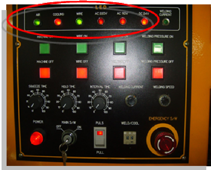
Figure 3. The control panel of the automatic welding machine, in line, with roller and wire by copper.

welding galvanized sheets, the zinc sticks on the mesh wire and the rolls of copper remains clean.